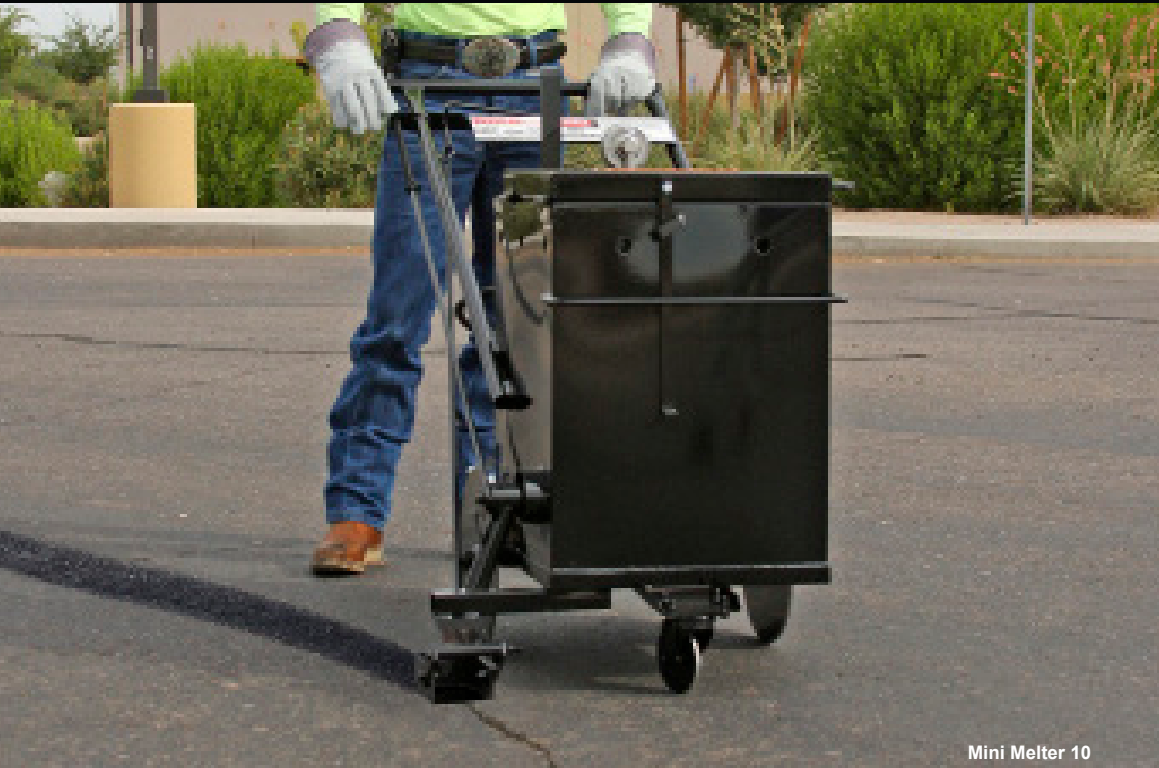
Mini Melter 10