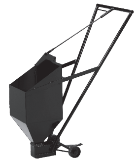
Pour Pot with Wheels