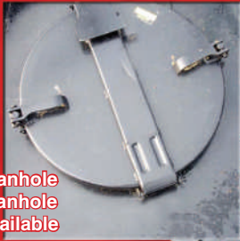
Side Manhole and Top Manhole available

“Safe” storage. CrafcO Emulsion storage tanks conveniently store emulsions on site for immediate use at truck load prices. They are available in 2,3,4,5,6,8, and 10 thousand gallon sizes. The Emulsion tank has 3” insulation with a 10-gauge steel secondary containment shell featuring an electric top-mount mixer. Options include an electric timer, mechanical float gauge, and an access ladder with cage.