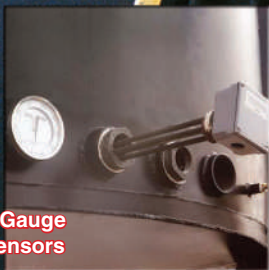
Temperature Gauge and Sensors