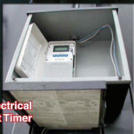
Electrical Heat Timer